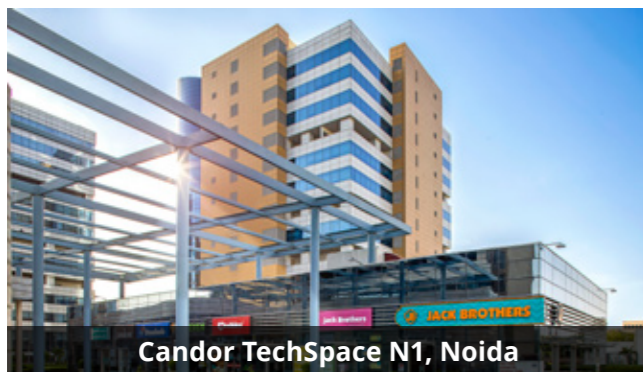
Candor TechSpace N1, Noida