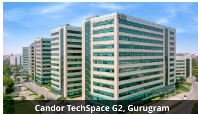
Candor TechSpace G2, Gurugram