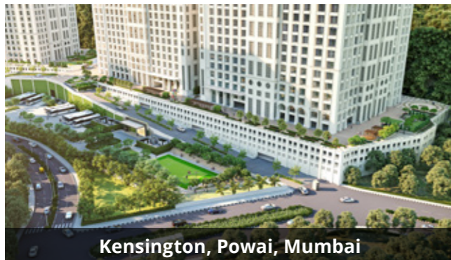
Kensington, Powai, Mumbai