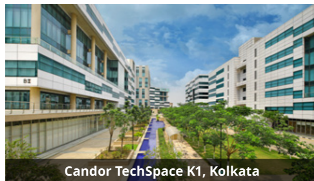
Candor TechSpace K1, Kolkata